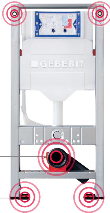
BS+ installation unit with concealed cistern Geberit Sigma item no. 211 088.01