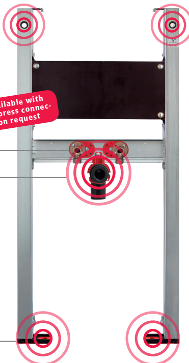
BS+ Washstand installation unit Without connections item no. 212 005.00 item no. 212 005.99

Also available with external press connections on request